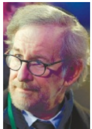
Steven Spielberg